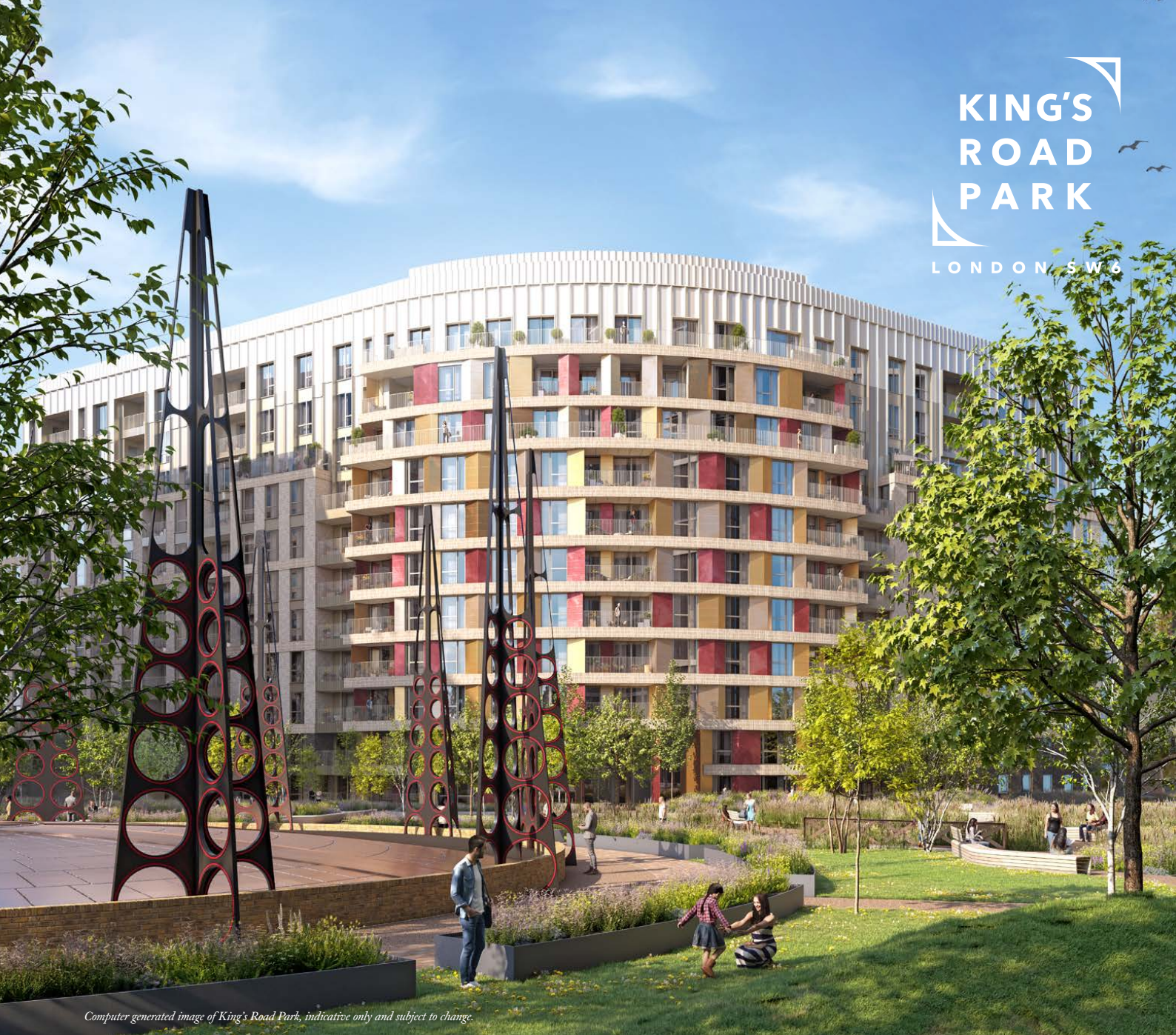
Computer generated image of King's Road Park, indicative only and subject to change.