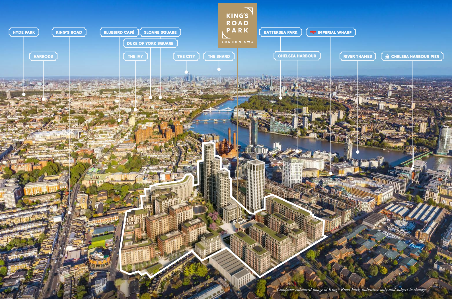
Computer enhanced image of King's Road Park, indicative only and subject to change.