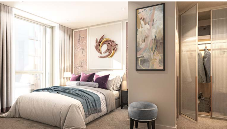
Computer generated image of King's Road Park, indicative only and subject to change.