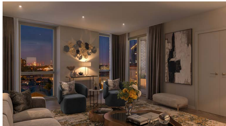
Computer generated image of King's Road Park, indicative only and subject to change.